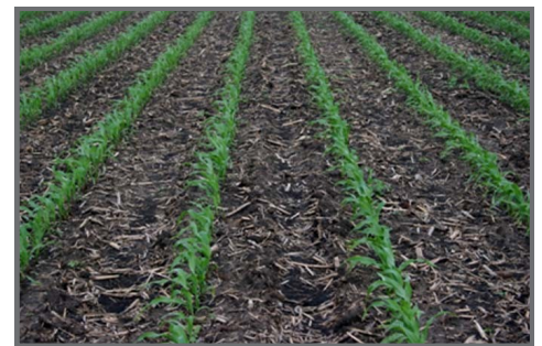
No Volunteer Corn