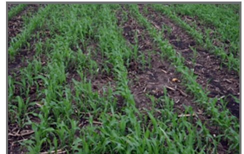
10 Ears Shelled