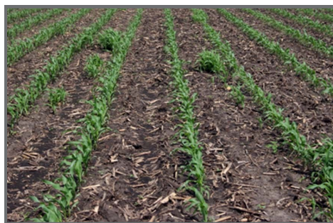
5 Ear Clumps