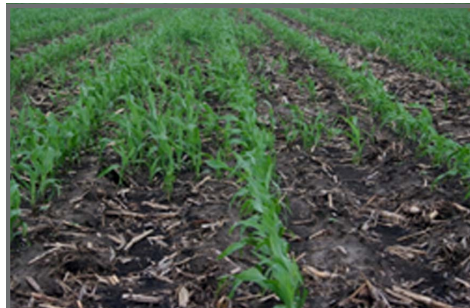
5 Ears Shelled