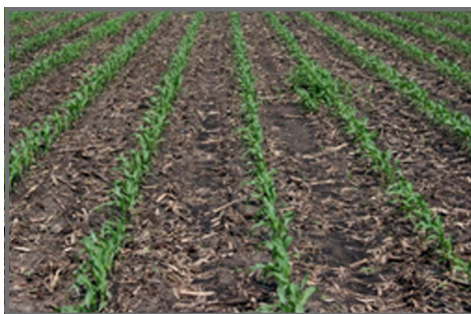
2 Ear Clumps