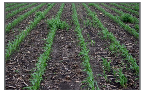
10 Ear Clumps

The information discussed in this report is from a single site, non-replicated, one-year demonstration. This information piece is designed to report the results of this demonstration and is not intended to infer any confirmed trends. Please use this information accordingly.