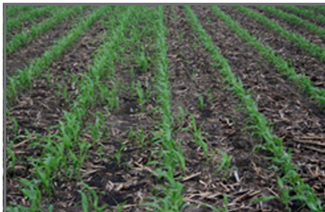
2 Ears Shelled