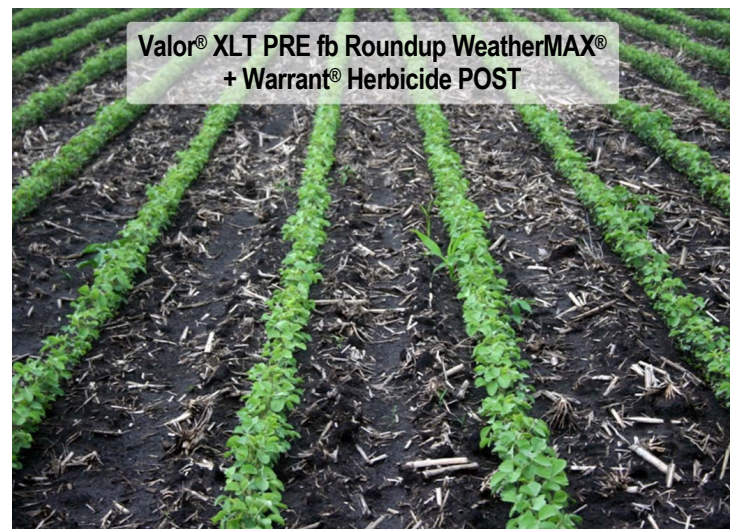
Figure 2. Weed control in a plot that received Valor® XLT (3 oz/acre) PRE followed by Roundup WeatherMAX® (22 oz/acre) + Warrant® Herbicide (1.5 qt/acre).