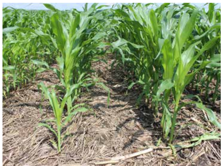
Figure 6. Corn crop on plot with cereal rye cover crop.