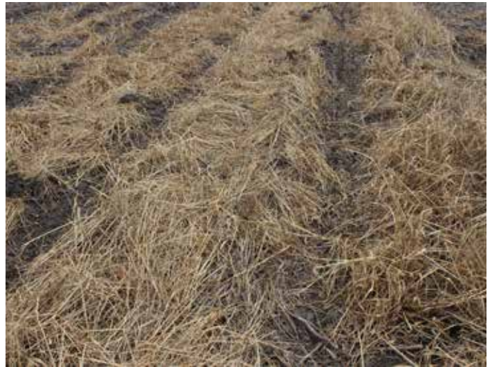
Figure 5. Cereal rye cover crop after corn planting.