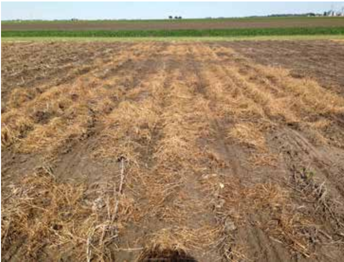
Figure 3. Annual rye cover crop prior to corn planting.

important variables are timing and method of cover crop establishment in the fall and termination of the cover crop in the spring. The Monsanto Learning Center at Monmouth, IL will continue to evaluate the impact of cover crops on yield and the most effective cover crop establishment practices.