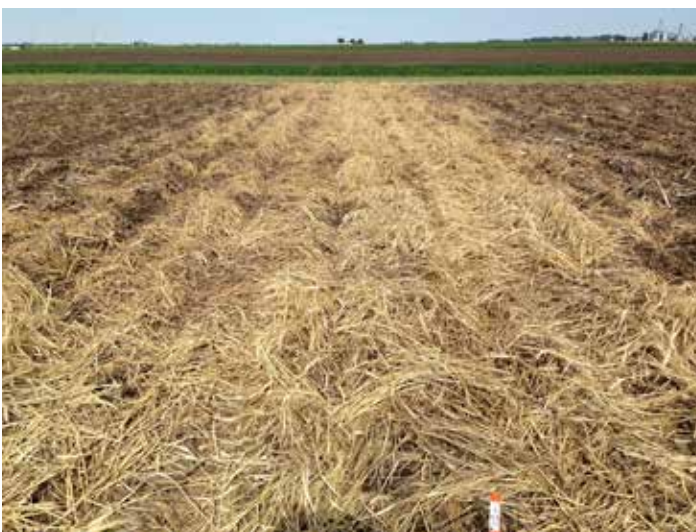
Figure 4. Cereal rye cover crop prior to corn planting.