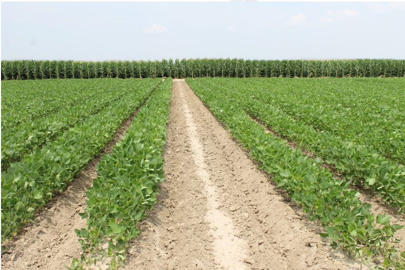
Figure 2. Treatment with one row missing.

Response of Four Asgrow® Brand Soybean Products to Common Planting Errors