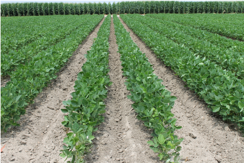
Figure 1. Treatment with missing pair of twin rows.

Response of Four Asgrow® Brand Soybean Products to Common Planting Errors