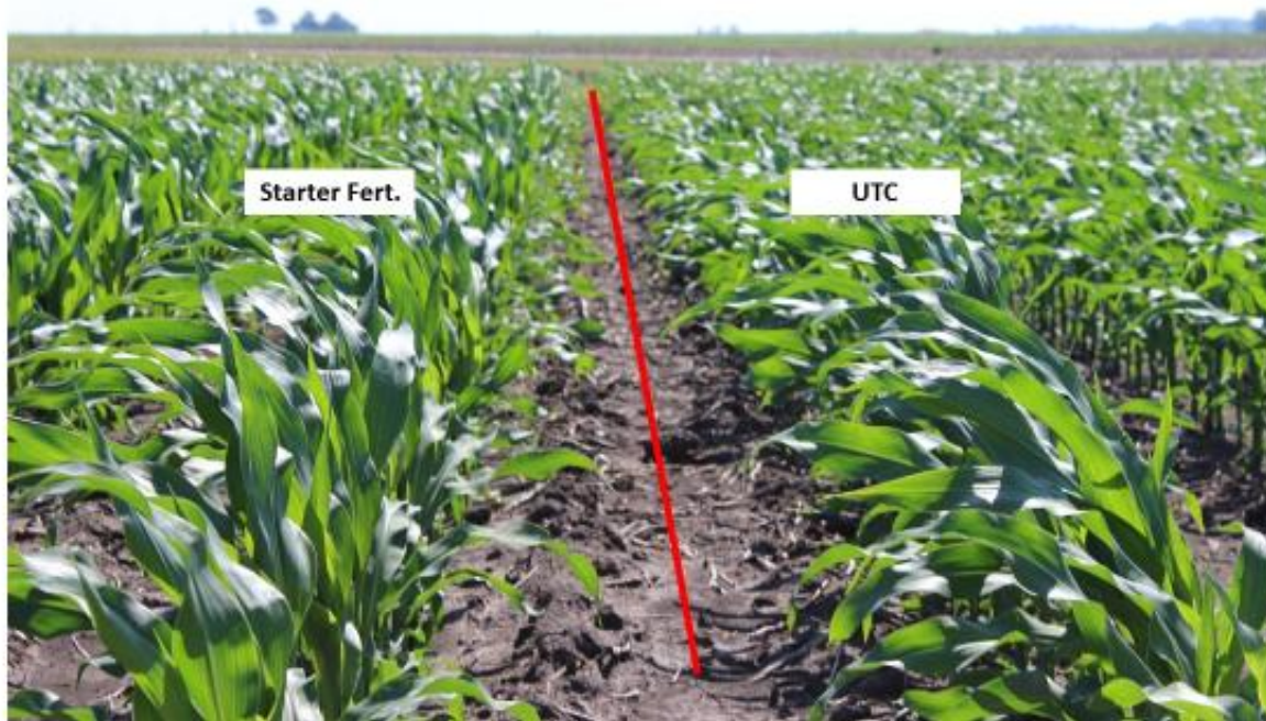
Figure 2. Corn receiving starter fertilizer may have a visual difference (left) compared to untreated check (UNT).