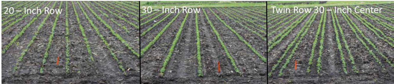
Figure 1. 20-inch rows (left); 30-inch rows (center); and twin rows on 30-inch center (right).