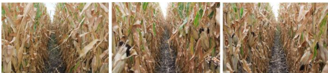
Figure 2. Plot photos: AF 34.5 lb. unit (left), AR 43.0 lb. unit (middle), and AR2 59.0 lb. unit (right)