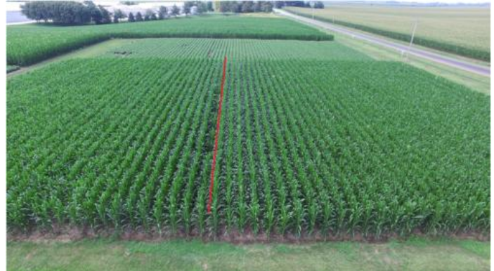
Figure 3. Improperly-set row cleaners without seed firmers (left) and properly-set row cleaners with seed firmers (right).