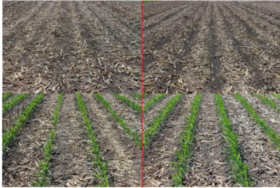
Figure 2. Improperly-set row cleaners without seed firmers (left) and properly-set row cleaners with seed firmers (right).